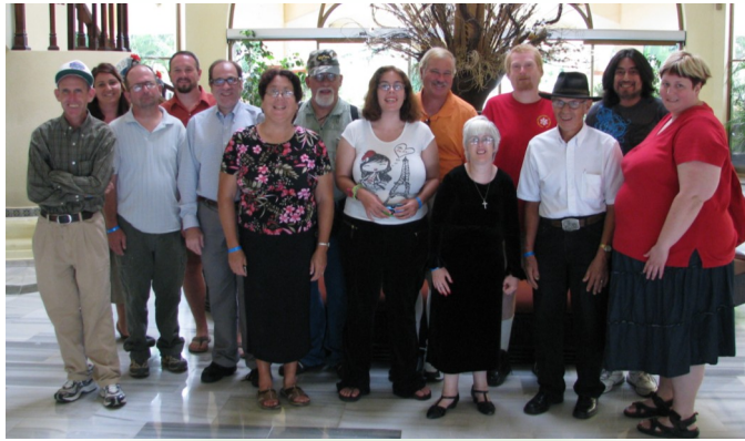
PUERTO VALLARTA, MEXICO ~ 2010

Do-It Leisure instructors assist clients in increasing their individual skills in order to live in the least restrictive environment possible. An assessment is completed to assist persons in establishing and maintaining a positive lifestyle and developing to their fullest potential. Programming may include: self-help skills, personal residence skills, nutrition and cooking, money management, emergency preparedness, comparative shopping, health and safety, personal hygiene, emotional functioning, and communication. Another component of ILS is parenting where we assist clients with learning the many things involved in raising a child and being an effective parent.